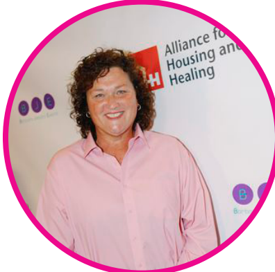
Dot Marie Jones