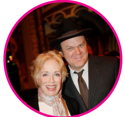
Holland Taylor & John C. Reilly