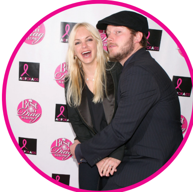
Chris Pratt and Anna Faris