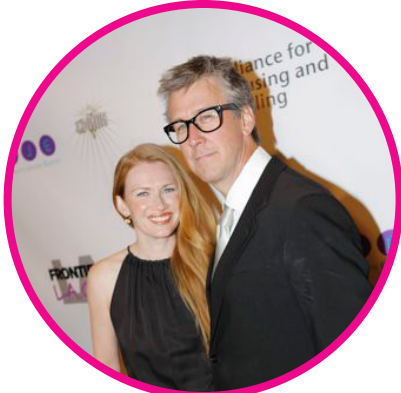
Mireille Enos & Alan Ruck